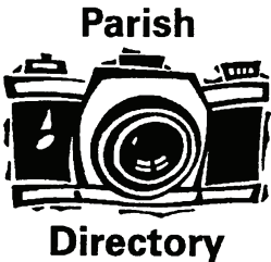
Photo Directory pictures are now being scheduled for March 5, 6, and 7th. Please go to our website to make your appointment. It is free and you will get a free 8x10 picture. You are under no obligation to purchase any pictures. If you have a picture you would like to use for the directory, please submit the picture to the parish office. If approved, there is a $10 fee to use the photo in the directory. Volunteers are also needed to assist with the photo directory portrait sittings. Contact the parish office and leave a message for Barb Demchak.