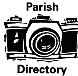
Photo Directory pictures are now being scheduled for March 5, 6, and 7th. Please go to our website to make your appointment. It is free and you will get a free 8x10 picture. You are under no obligation to purchase any pictures. If you have a picture you would like to use for the directory, please submit the picture to the parish office. If approved, there is a $10 fee to use the photo in the directory.