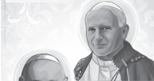
SAINT JOHN PAUL II

"The world you are inheriting is a world which desperately needs a new sense of brotherhood and human solidarity. It is a world which needs to be touched and healed by the beauty and richness of God's love."